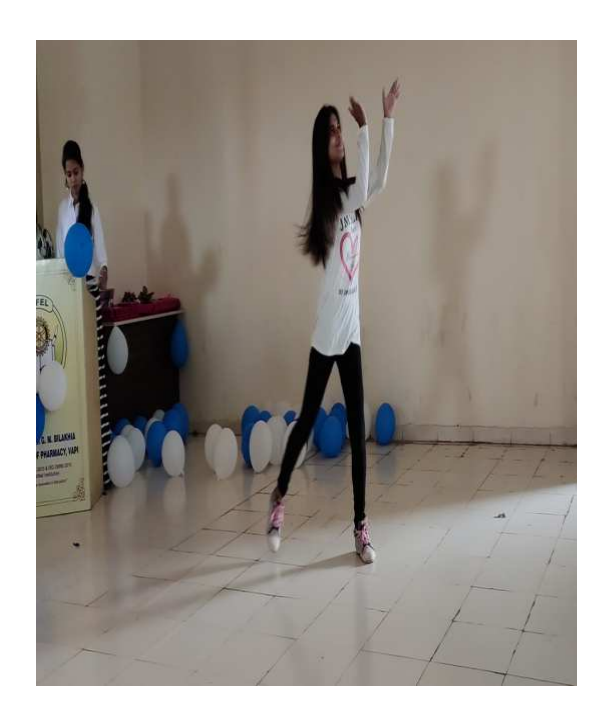
Cultural Programme arranged by students