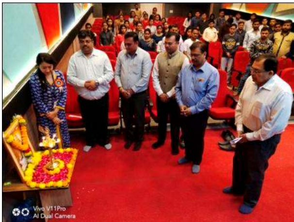
Lamp Lighting Ceremony