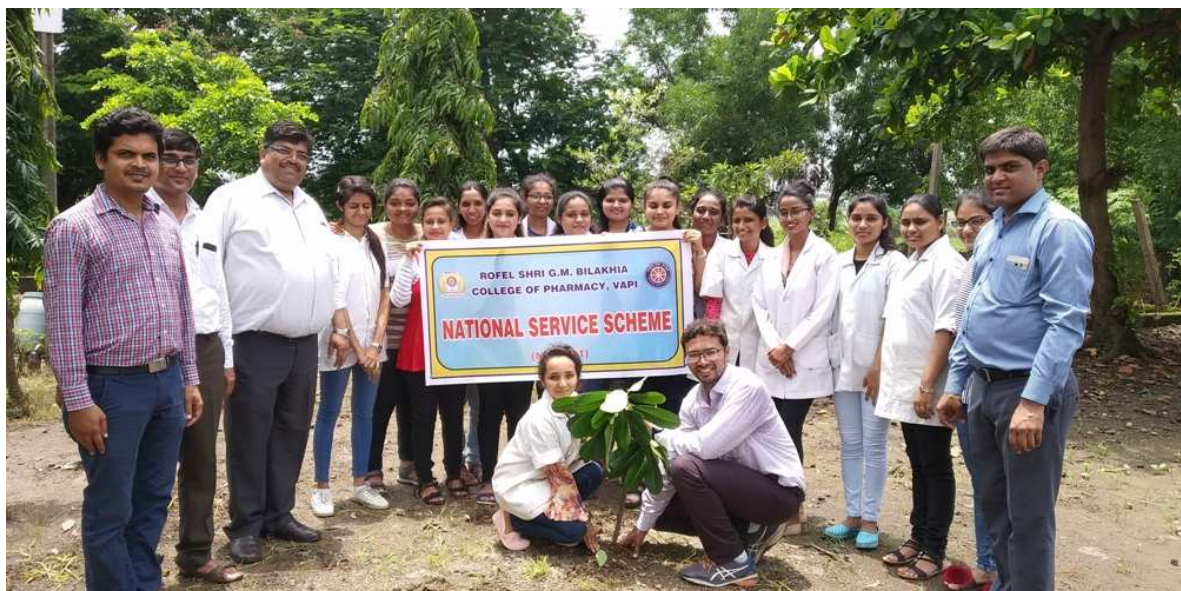
TREE PLANTATION AT THE CAMPUS