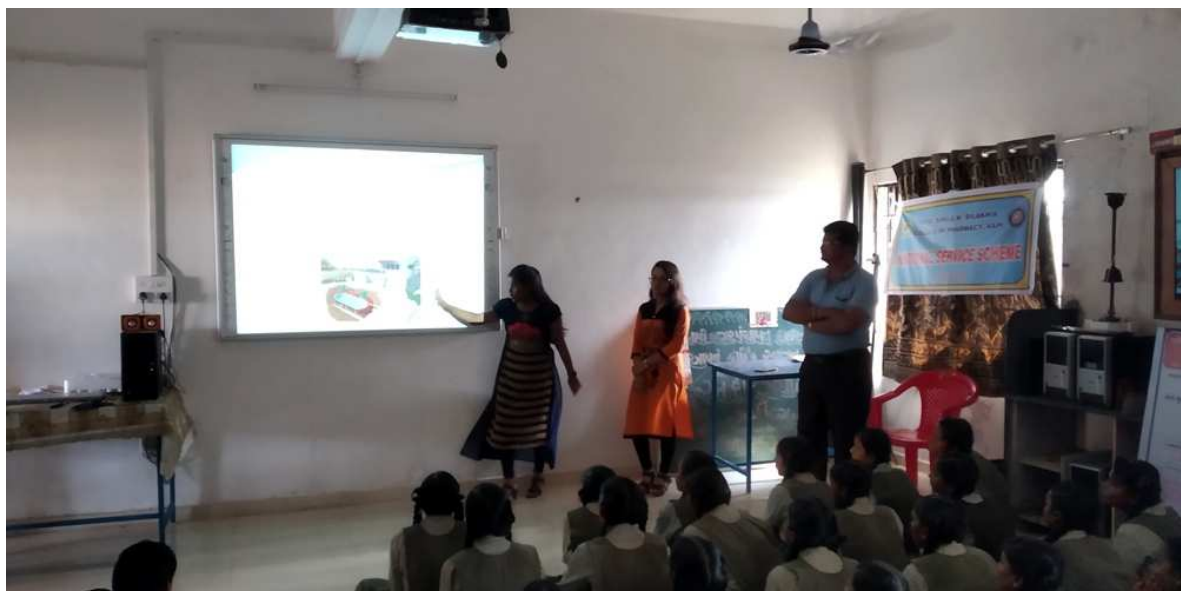
AWARENESS CAMPAIGN ON WATER CONSERVATION IN NEARBY SCHOOL