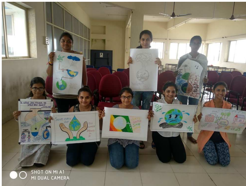
POSTER MAKING COMPETITION ON THEME OF 'WATER CONSERVATION'

Tel: 9727723722 | 42 | 62; Email: rofelpharm@gmail.com; website: www.rofelpharma.org